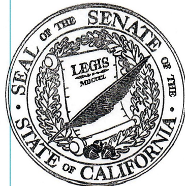
Honorable Tani G. Cantil-Sakauye Chief Justice of California